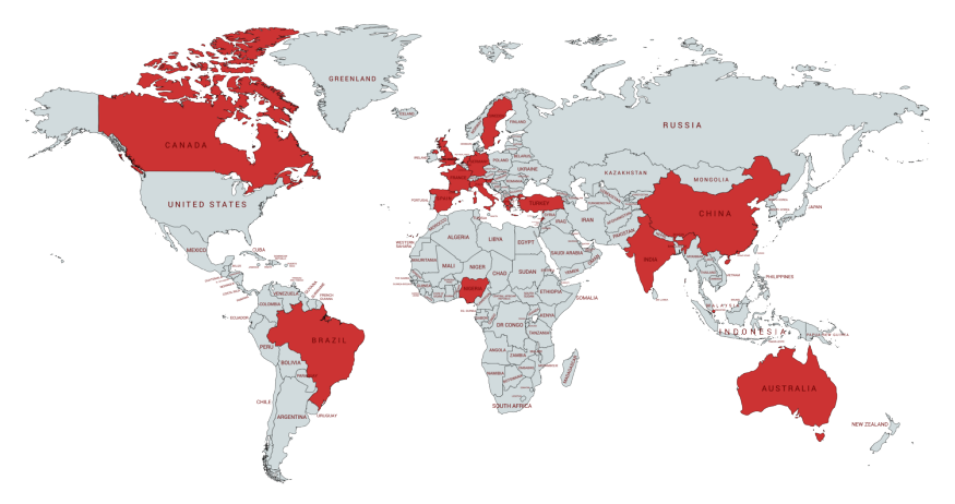
Figure 1. Provenance of the registered participants.

Full details about the tested software can he found in the web page (https://3d.bk.tudelft.nl/projects/geobim-benchmark/software.html). And full list of participants at https://3d.bk.tudelft.nl/projects/geobim-benchmark/participants.html. The balance in skills, working field, interests and geographical provenance (Figure 1) offered the possibility to minimize bias in the results.