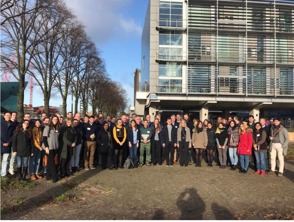
Figure 4. Pictures of the GeoBIM benchmark workshop.